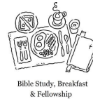
Bible Study, Breakfast & Fellowship

The men's group will be considering JESUS, THE CARPENTER throughout the year, with various men leading the devotional and discussion each month. The women will continue to enjoy Christian fellowship. Everyone is welcome – see you September 6 th !