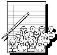
New Member Class

There will be a New Member class offered on Sunday afternoon, October 5, 1:30 – 4:00 pm. Anyone interested in joining the church, or learning more about the Christian faith and the Presbyterian reformed tradition, is welcome to attend! Childcare will be provided upon request – please phone the church office by October 1 st so we can arrange for a babysitter.